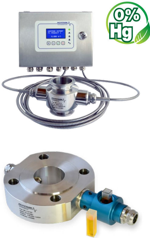
Integrated verification & calibration accessory.

Kemtrak manufactures high performance industrial process photometric, fluorescence and turbidity analyzers. Simple to use and zero maintenance.