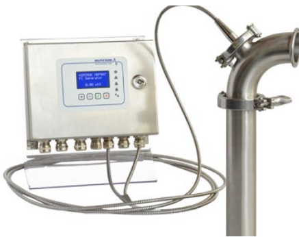
ISO 7027 compliant measurement (top) and TriClamp backscatter probe (bottom).