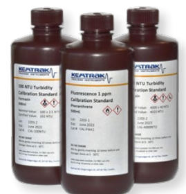
Liquid calibration standards.

Certified liquid reference standards are ideal for routine verification, calibration and ensuring good inter-laboratory or inter-instrument correlation.