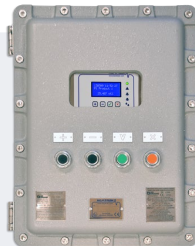
EExD enclosure with four push-buttons for complete control in zone 1 environments.