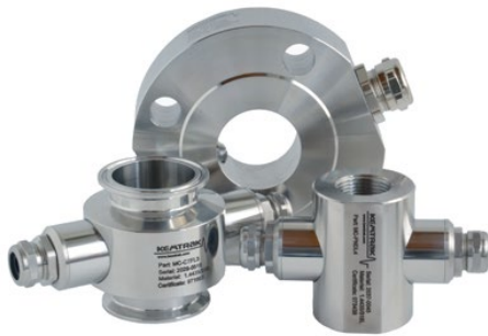
Robust zero maintenance measurement cells.