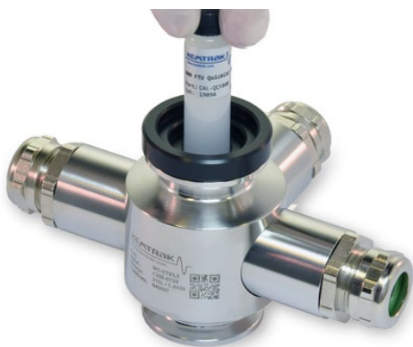
QuickCal "liquid free" ISO 7027 formazine turbidity calibration.

All Kemtrak products are manufactured from the highest quality materials and are designed to the most demanding specifications to ensure long life and the highest reliability.